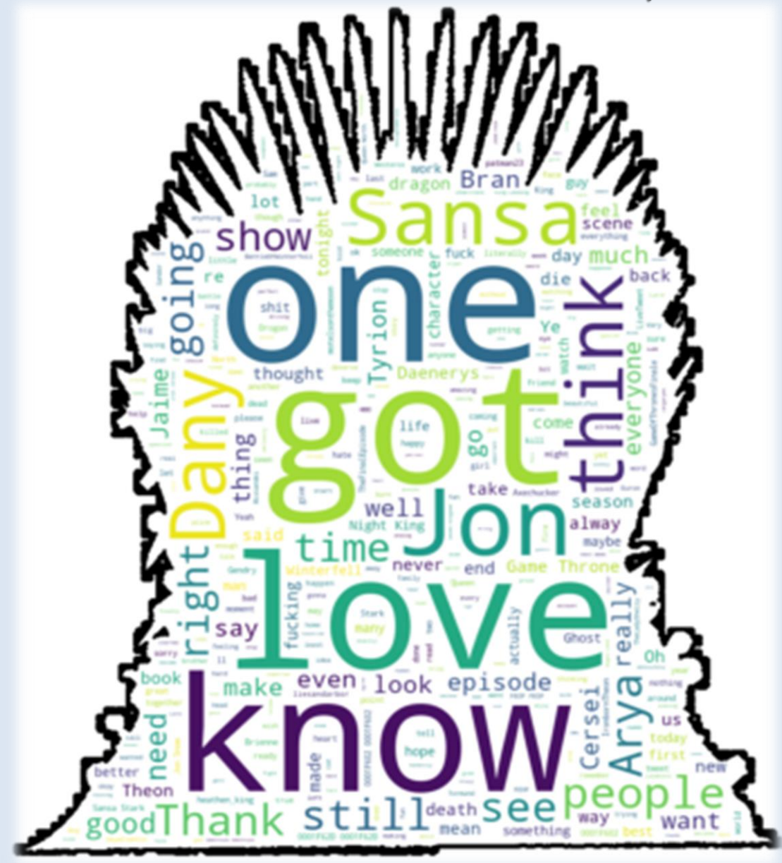
Word frequency map generated from dataset.